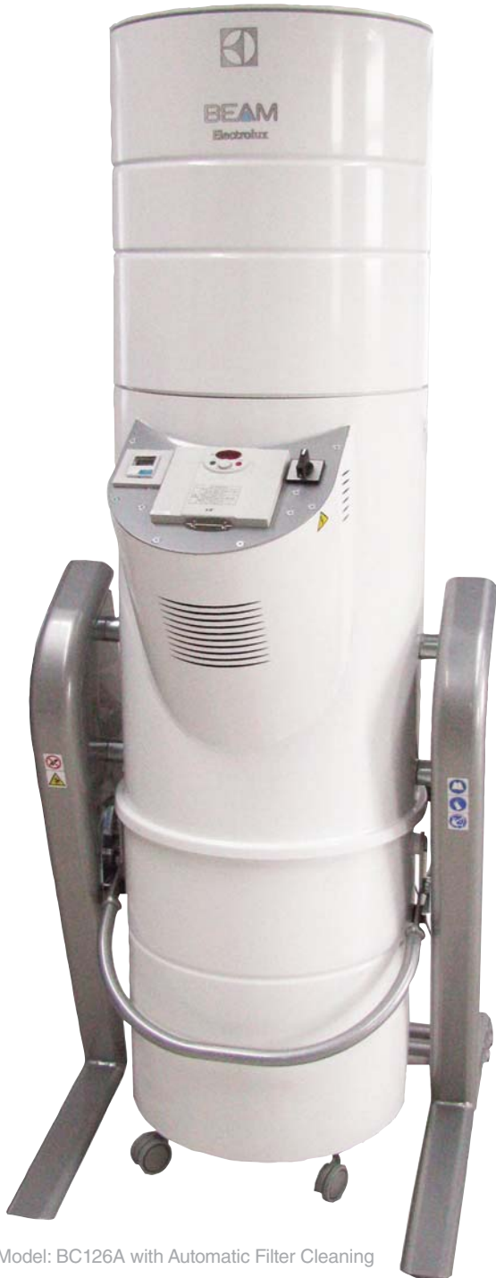
Model: BC126A with Automatic Filter Cleaning

The Beam Commercial single-user power units are designed following a modular concept enabling, the design of a system for your exact cleaning demands.