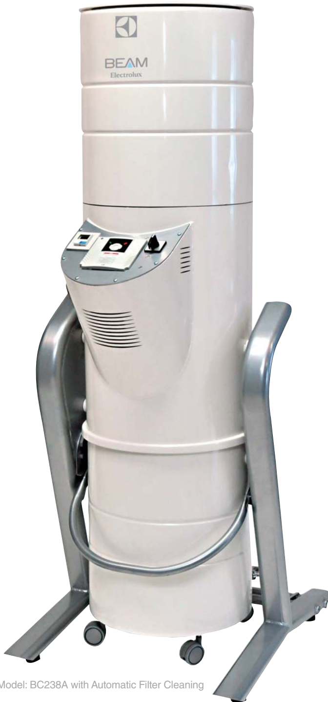
Model: BC238A with Automatic Filter Cleaning

The Beam Commercial multi-user power units are designed following a modular concept enabling, the design of a system for your exact cleaning demands.